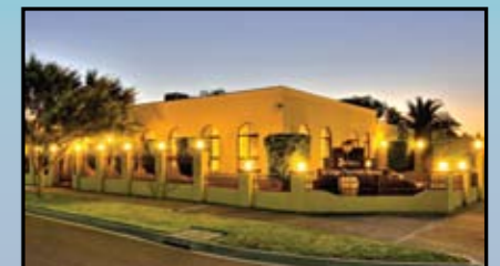
2 Bee Teng Court