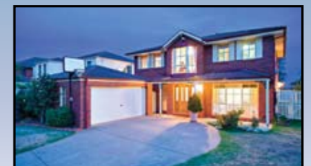
17 Atherton Close