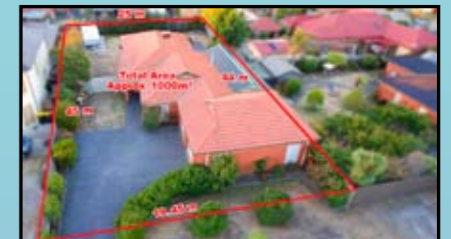
3 Armer Court