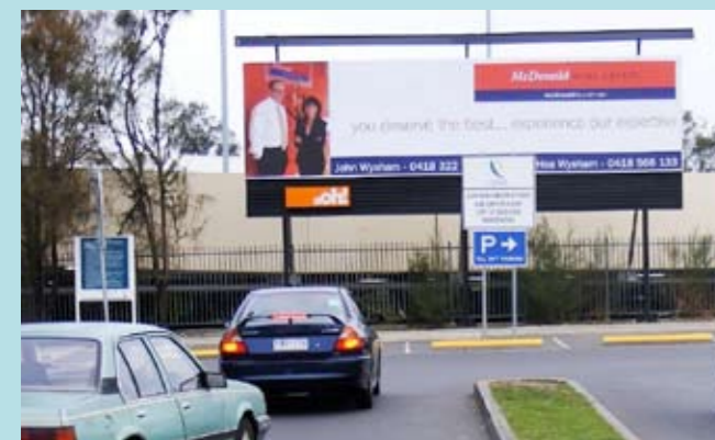
VIC, Keysborough, Parkmore Shopping Centre (Kingsclere Rd - East entry)

Here are 2 we have been promoting over autumn and early winter 2009.