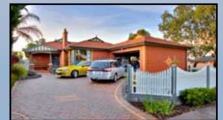
10 Lance Close